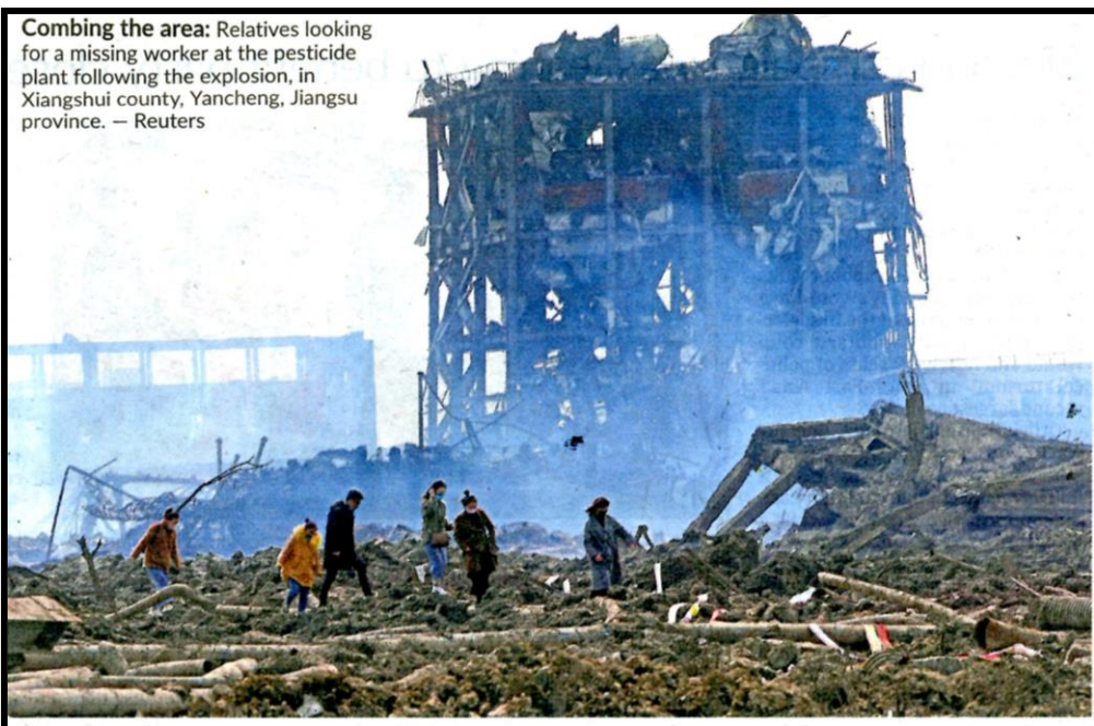
Combing the area: Relatives looking for a missing worker at the pesticide plant following the explosion, in Xiangshui county, Yancheng, Jiangsu province.