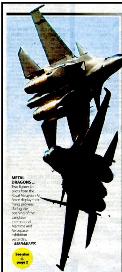
METAL DRAGONS ... Two fighter jet pilots from the Royal Malaysian Air Force display their flying prowess during the opening of the Langkawi International Maritime and Aerospace exhibition yesterday.