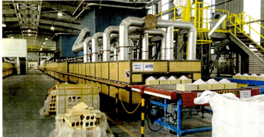
Lynas Corp Ltd is facing problems in getting licence renewals for its US$800 million processing plant in Malaysia due to concerns over its waste storage.

"It seems like a risky proposition. They have permitting issues