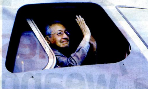
Mahathir waves from Jet Embraer's E190-E2 at the Mahsuri International Exhibition Centre yesterday.

"It was a bold move for some and baby steps for others. But looking at what we have before us in the development of the aerospace industry today, it was a necessary move to ensure that